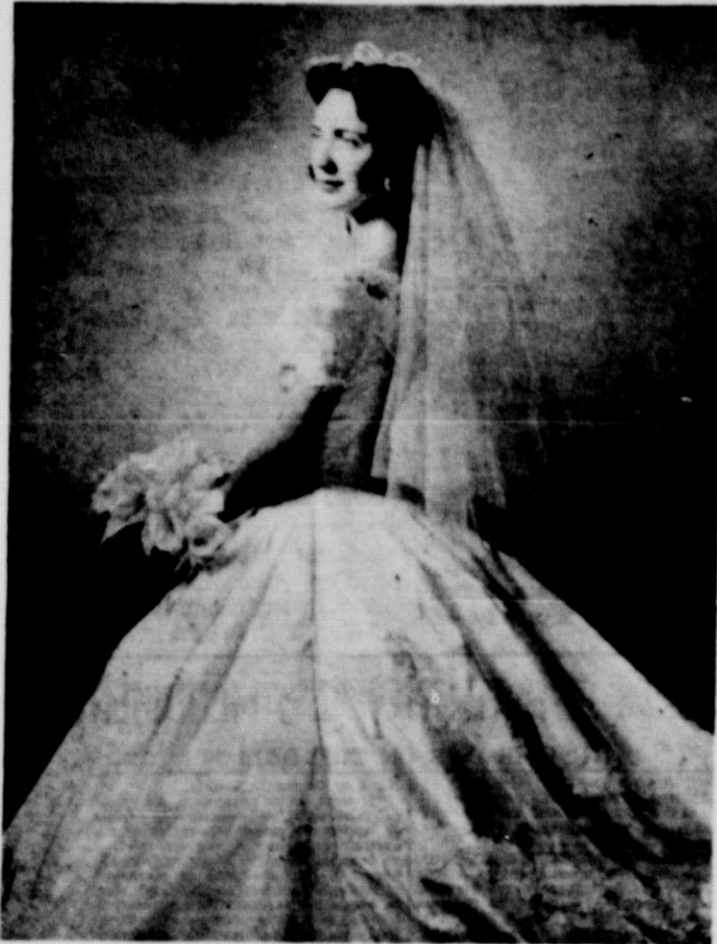
ENGRAVING COURTESY MOOD COUNTY NEWS-TABLET