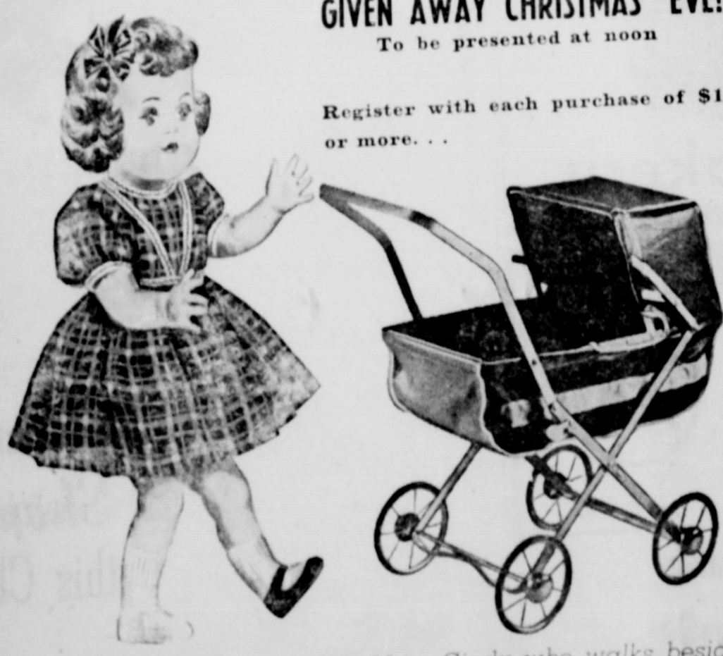
HORSMAN'S "WALK-A-BYE" 36-in. Cindy who walks beside the deluxe folding doll buggy. Inside buggy is "Baby Sister"!