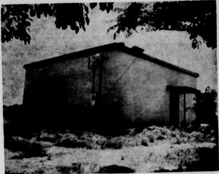
RESPONSIVE MECHANICAL SLAVES in the above small building on Lariat Street will say "goodbye to 'hello' girls" in Matador August 1. The windowless "maximum security" structure houses the intricate mechanism of General Telephone's new automatic dial system which will be "cut-over" early Wednesday, August 1. The new system, most modern available, will eliminate the switchboard system used in Matador for approximately 70 years.