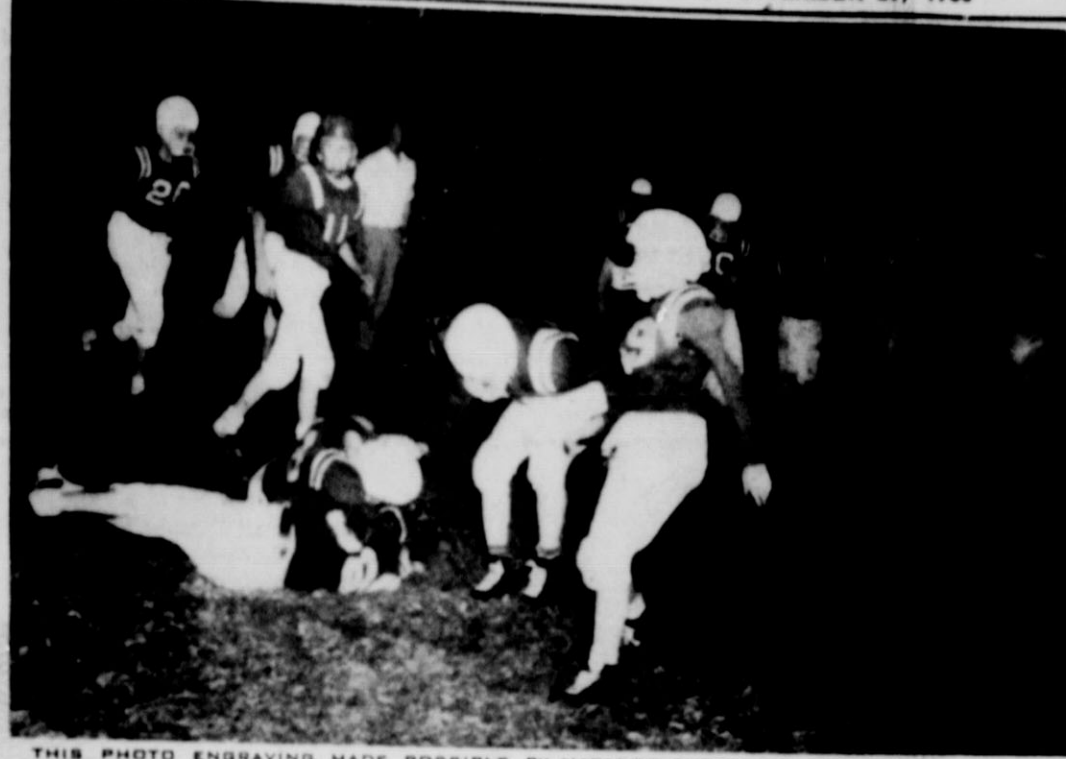
THIS PHOTO ENGRAVING MADE POSSIBLE BY MATADOR FLORAL COMPANY

By DOUGLAS MEADOR Only $1.19 Only $1.09 Only $0.79 Only $0.59 Only $0.49 Only $0.39 Only $0.29 Only $0.19