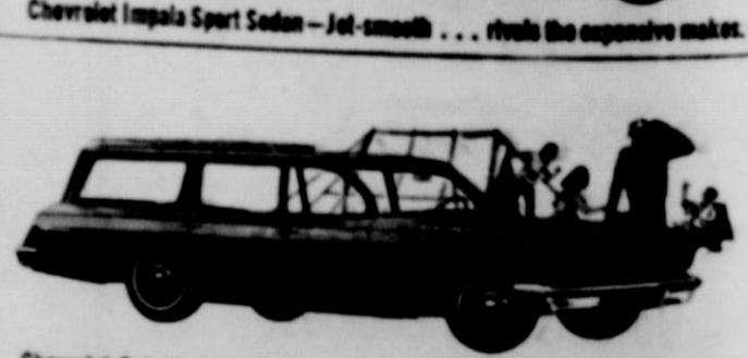
Chevrolet Bel Air 5-Passenger Station Wagon—Just about all the station wagon anyone could want. Roof Luggage Carrier is optional at extra cost.

See your local authorized Chevrolet dealer