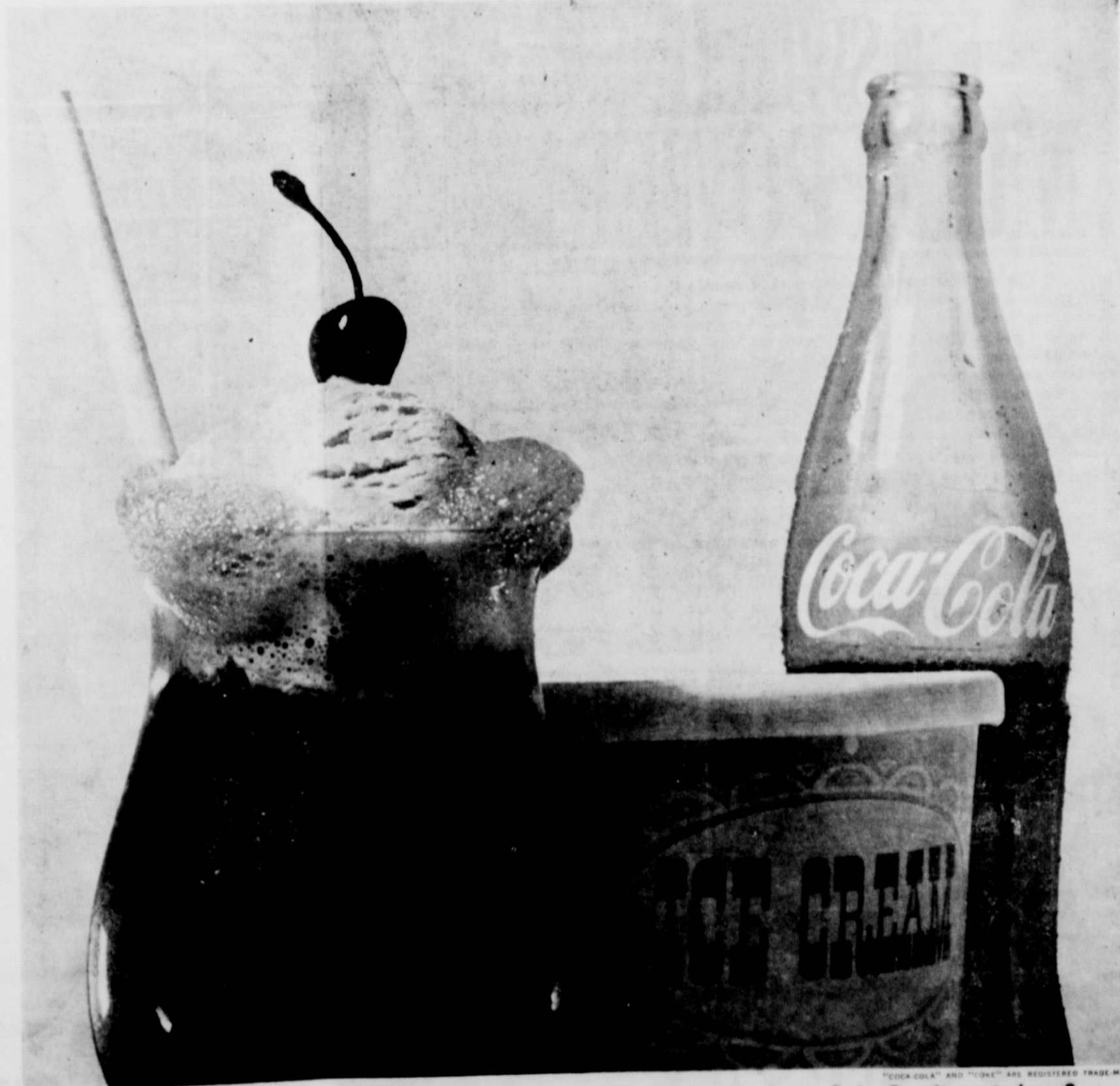
Bottled under authority of The Coca-Cola Company by Paducah Coca-Cola Bottling & Ice Company

ZING! enjoy that REFRESHING NEW FEELING!