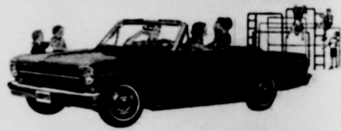
Chevy II Nova Convertible—Thrifty way to get in on top-down traveling!