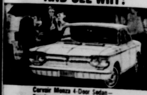
Corvair Monza 4-Door Sedan—Sports car spice on the family plan.