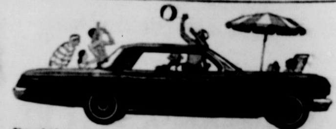
Chevrolet Impala Sport Sedan—Jol-smooth... rivals the expensive makes.