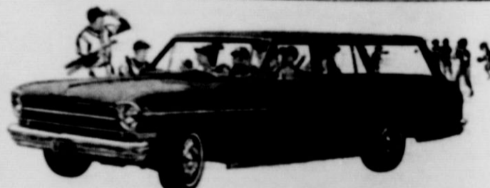
Chevy II Nova Station Wagon—Family-sized, easy to park, pack, pay for!