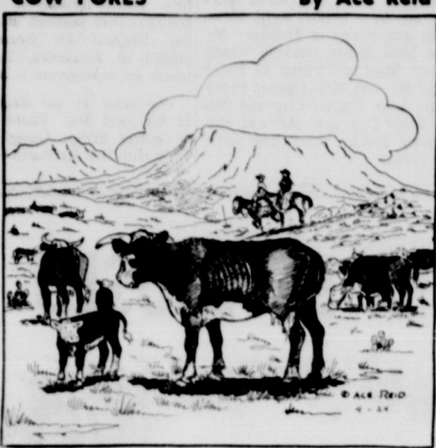
Yep, the same of story . . . they're born in the spring, mortgaged in the summer and fee in the winter."

This feature sponsored by THE FIRST STATE BANK