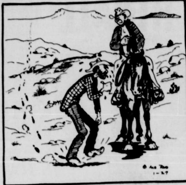
"Nope, I didn't get bucked off no hoss, my jeep's outa gas."

This feature sponsored by THE FIRST STATE BANK