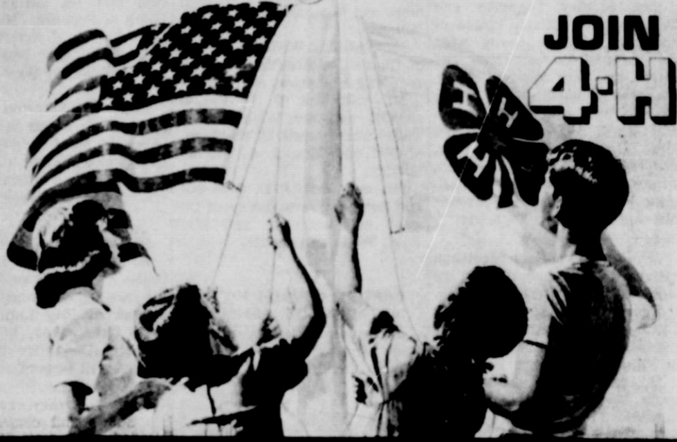
Extension Service of the State Land Grant College and University and the U.S. Department of Agriculture