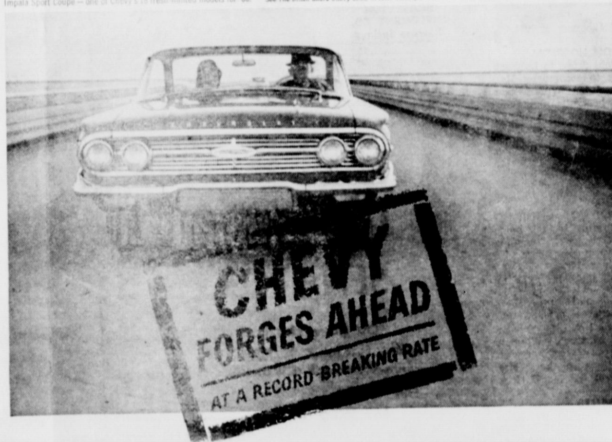
Impala Sport Coupe—one of Chevy's 15 fresh-minded models for '60. See the Great Show Chevy Show in color Sundays, NBC-TV. The Pat Boone Chevy Showtime weekly, ABC-TV.

Factories are turning out more new Chevrolets every day. More proud new Chevy owners taking to the road. Now's the time to see your dealer for fast delivery and a favorable deal!