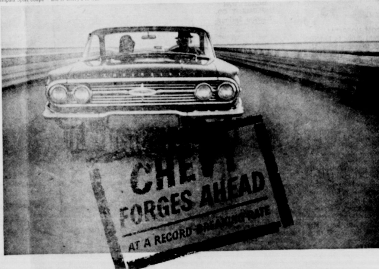
Impala Sport Coupe - one of Chevy's 16 fresh-minded models for '60. See The Dash Show Chevy Show in color Sundays, NBC-TV... The Pat Boone Chevy Showtime weekly, ABC-TV.

Factories are turning out more new Chevrolets every day. More proud new Chevy owners taking to the road. Now's the time to see your dealer for fast delivery and a favorable deal!