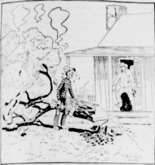
Hey, Boss, shore found you some fine stove wood, didn't I?

This feature sponsored by THE FIRST STATE BANK