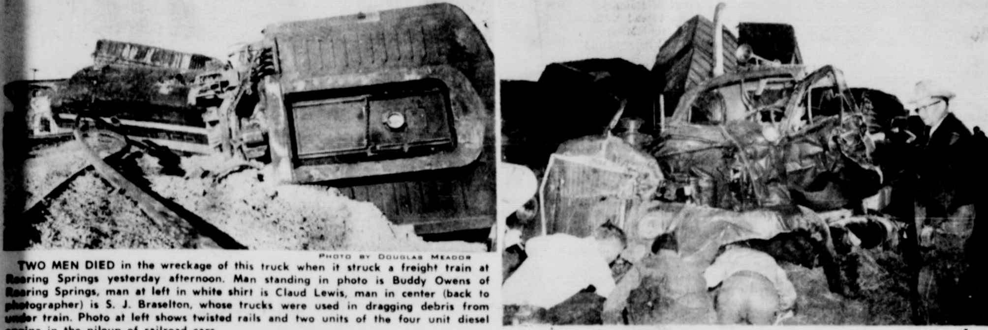
TWO MEN DIED in the wreckage of this truck when it struck a freight train at Roaring Springs yesterday afternoon. Man standing in photo is Buddy Owens of Roaring Springs, man at left in white shirt is Claud Lewis, man in center (back to photographer) is S. J. Braselton, whose trucks were used in dragging debris from under train. Photo at left shows twisted rails and two units of the four unit diesel engine in the pileup of railroad cars.

DEATH WAITED at a grade crossing in Roaring Springs yesterday afternoon for two Amarillo men until their loaded grain truck crashed into the first of a four diesel engine unit of a Quannah, Acme & Pacific freight train.