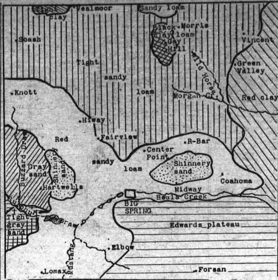
Pictured above is a soil map of Howard county, showing the division of the county as to soil types. Major drainage channels are shown also.

In the northeastern portion of the county, tremendous amounts of water from rugged country course down Wild Horse and Morgan Creeks in seasons of hard rain. Over all the county there is a decided southward tilt, causing gulches and uncharted drainage channels to crease ranges and often times fields.