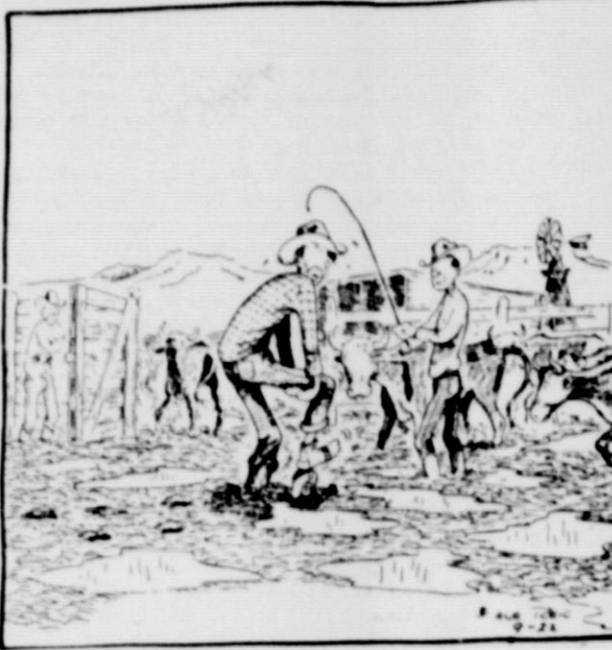
"The thing about these droughts—it gives a feller time to forget just how muddy a dang cow lot gets."

This feature sponsored by THE FIRST STATE BANK