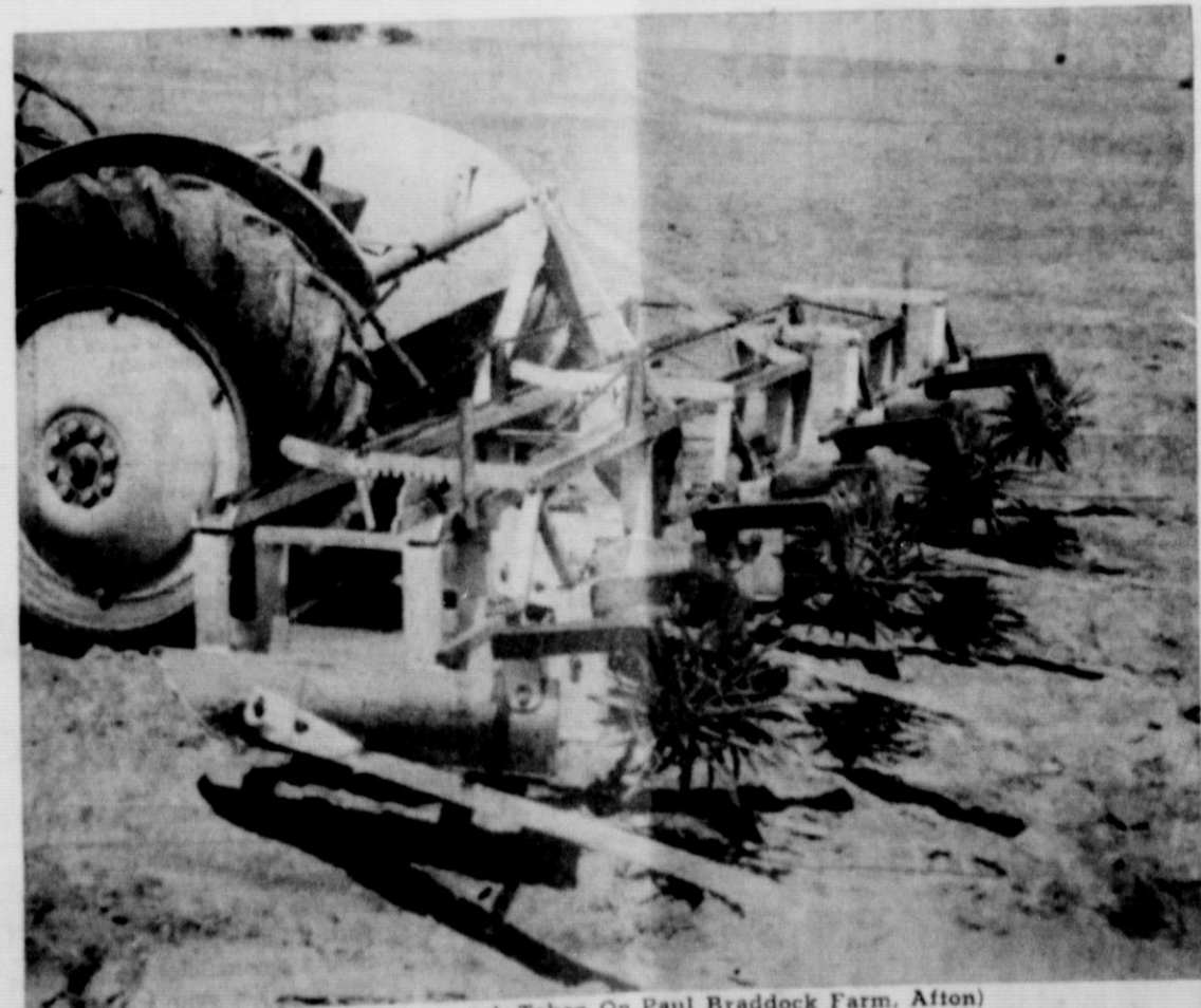
(Actual Photograph Taken On Paul Braddock Farm, Afton)

MADE IN Motley County FOR MOTLEY COUNTY CONDITIONS 4-ROW Price $175 COMPLETE WITH KNIVES, FENDERS AND SCRATCHERS —Rotary Hoes $10 per Row Extra— 2-Row Model . . . . $85.00