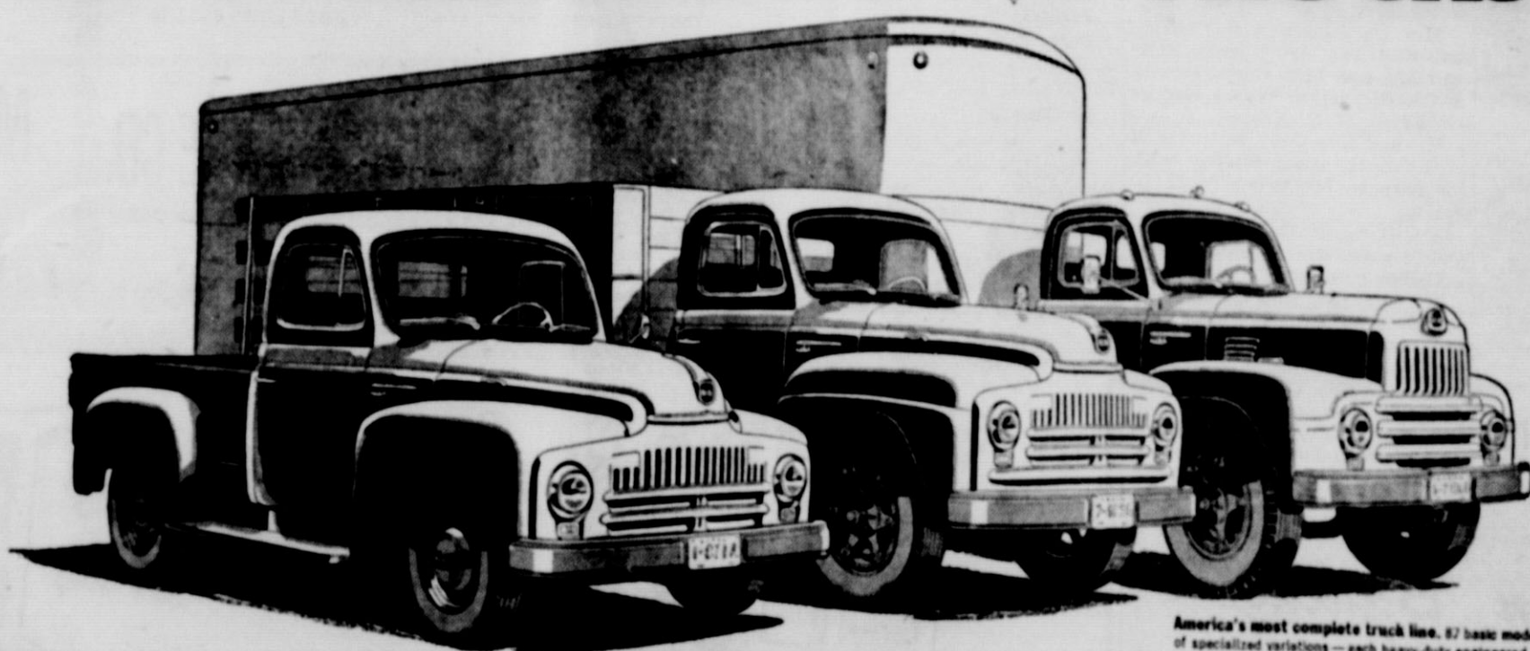
America's most complete truck line. 67 basic models thousands of specialized variations—each heavy-duty engineered.

Every International Truck in the line is all new. And every new International Truck from 4,200 to 90,000 pounds GVW is HEAVY-DUTY ENGINEERED!