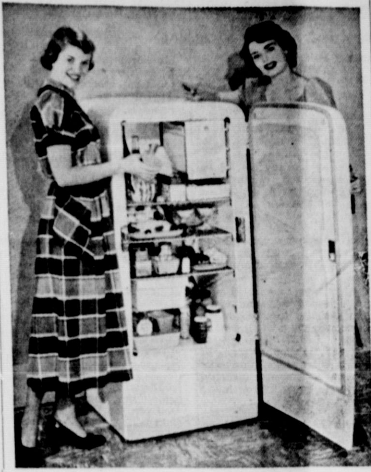
ALL AGREE: "BIG ENOUGH FOR ME"