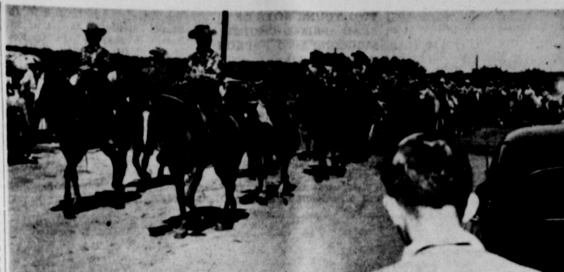
COLORFUL MATADOR RIDING club is shown as it follows the flag-bearers in the parade Thursday morning in Roaring Springs. Approximately 4,000 people watched the parade in which over 200 horses appeared. Floyd County Sheriff's Posse which rode in the parade, was declared winner in the riding club division.