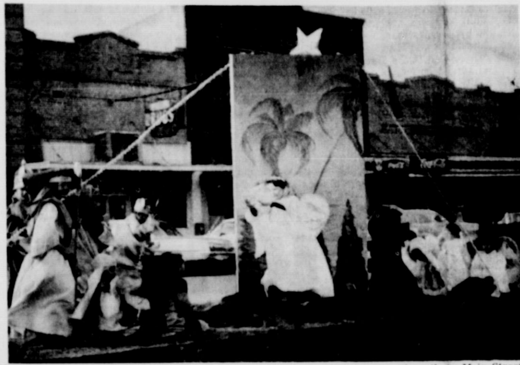
PRIZE-WINNING FLOAT entered by Patton Springs, shown as it passed north on Main Street. Many of the children "angels" were suffering from the severe cold weather.

There was a period in his life when the tall man sang in his and his eyes laughed at the sky of white clouds and the sky. It was before he met the brown-eyed girl who loved the haunted his eyes. Youth was a bowl of wine in her hands and the wine was no longer young. He hurt in silence and put hands around the soft throat. He never spoke of the and the fires that dumped news into his thoughts. The went on into the world with dreams of lasting happiness. The farmer returned to his the white clouds and the blue skies.