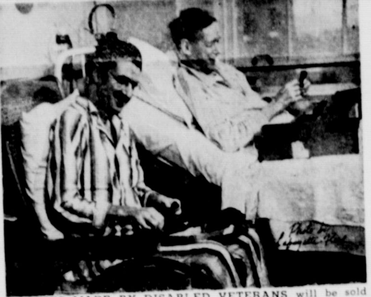
POPPIES MADE BY DISABLED VETERANS will be sold over the nation Saturday, official "Poppy Day", by American Legion Auxiliary. They are crepe-paper replicas of the wild poppies which grew on the battlefields in Europe where so many Americans gave their lives in both world wars. Making them has provided gainful employment and valuable occupational therapy for thousands of veterans in hospitals and convalescent workshops in all parts of the country during the past winter and spring.