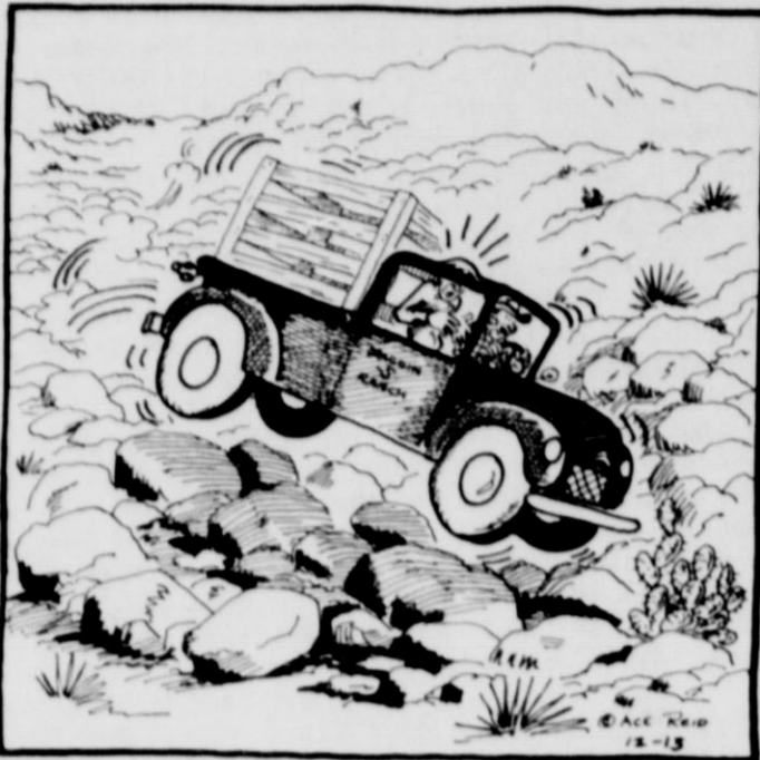
"Hey, don't these pickups beat gittin' yore insides shook up on them ole rough hosses!"

This feature sponsored by THE FIRST STATE BANK