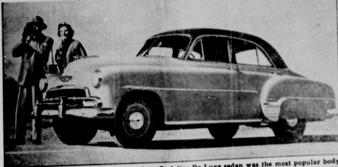
Chevrolet records indicate the four-door Styleline De Luxe sedan was the most popular body model in the country in 1951. Above, it is shown in its 1952 design, more striking in appearance and improved in performance over earlier models. Headlining some notable contributions to motoring pleasure are smoother riding qualities and responsive performance under all sorts of weather conditions.

Mrs. Guy Kimbell and daughter, Melba, spent Thursday visiting and shopping in Lubbock.