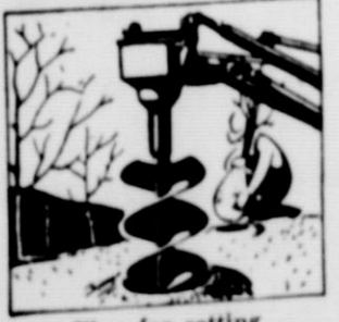
Fine for setting out seedlings.

If you have seedling trees to set out, or holes to dig for building pilings or foundations, there's nothing like this post hole digger. Even use it for digging trenches. . . saves lots of shoveling. Several size augers. . . Ask for a demonstration.