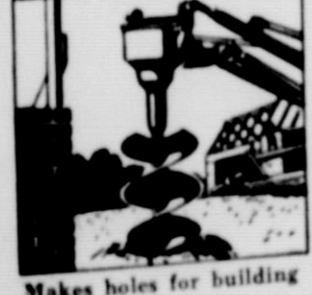
Makes holes for building foundations.