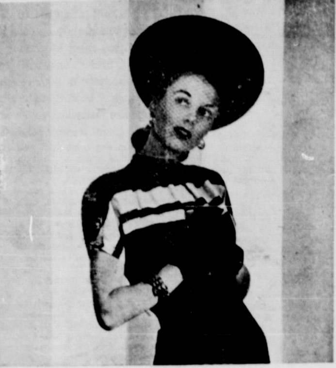
Extremely slimming and a black dress that lends color to the face is the one shown above as pictured in the February issue of Good Housekeeping magazine. An everfast washable rayon, it is a midnight black with slashes of lime, blue or pink.

Laugh—James White Hands—Hal Courtney General appearance—Fud Edmondson. —M. H. S.—