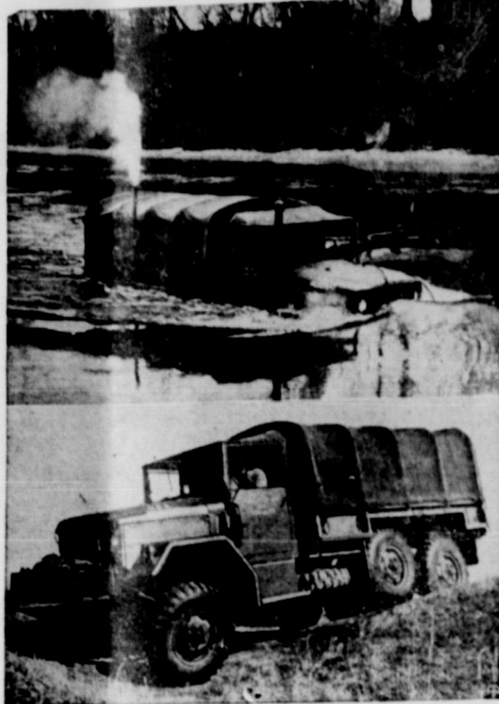
Here's a brand new Army Ordnance vehicle—the "Eager Beaver". The 2½-ton truck, now in full production at Reo Motors' plant in Lansing, Mich., is built for high speed on and off the highway, and is designed to operate normally in sub-zero cold, blistering heat, or with its Gold Comet engine completely submerged in water. Reo has been awarded contracts for approximately 8,500 of them at a cost of about $55,000,000. In the top panel, the "Eager Beaver" is shown "cruising" in Chesapeake Bay, Maryland.