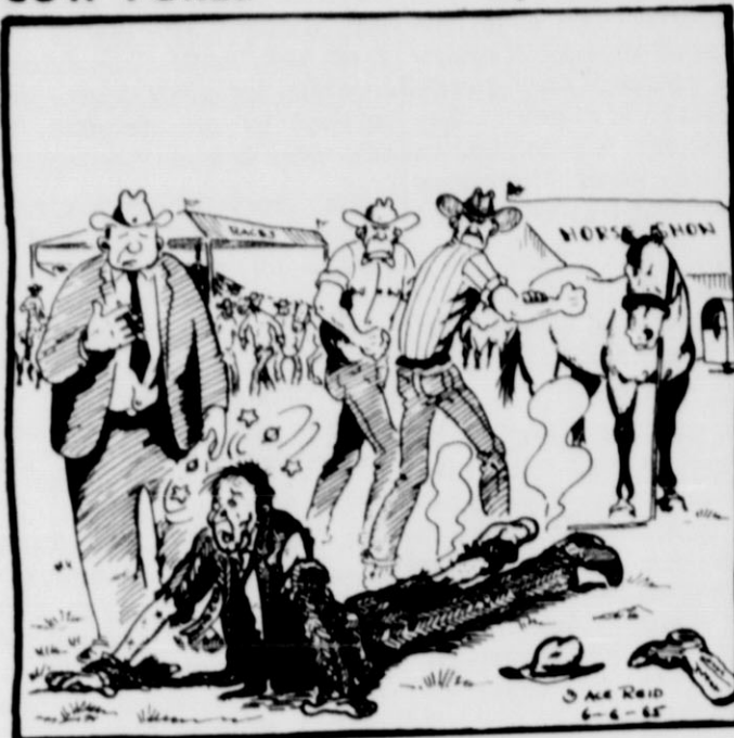
"Judge, seems like you ain't too popular any more!"

This feature sponsored by THE FIRST STATE BANK