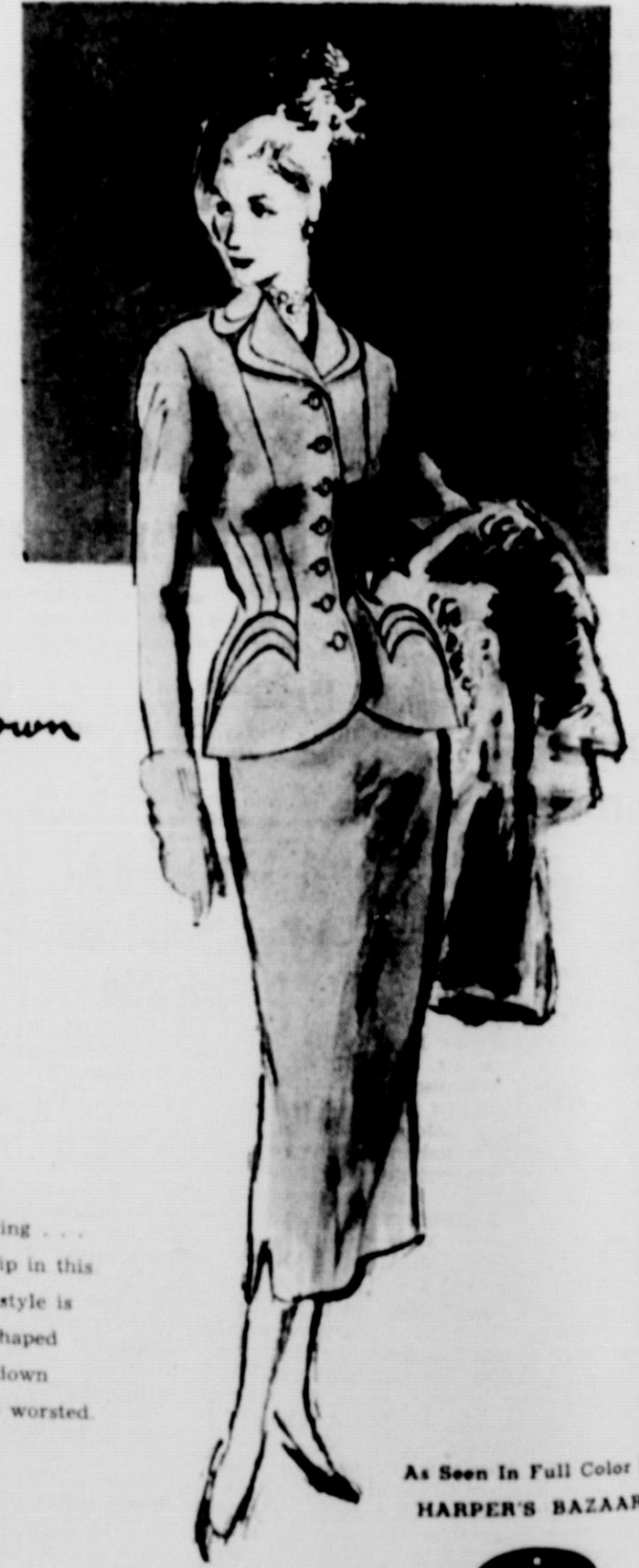
As Seen In Full Color In HARPER'S BAZAAR