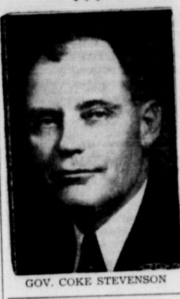
GOV. COKE STEVENSON