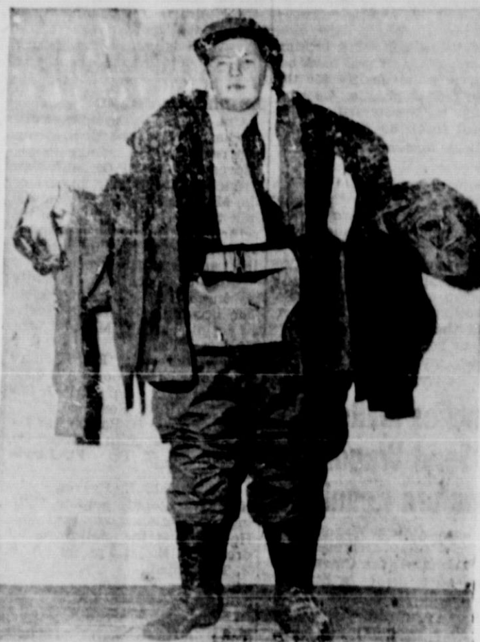
As one of the soldiers in Operation Muskox, a joint enterprise of the U. S. and Canadian armies to test Arctic conditions, the G. I. shown above as pictured in the April issue of Science Illustrated magazine wears seven layers of apparel: "fishnet" underwear, regulation underwear, heavy flannel shirt, high-neck sweater, water-repellent battle dress, parka pile liner, parka trimmed with wolf, and two scarves as insulators.