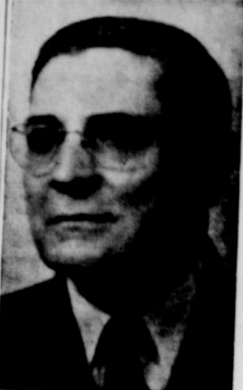
Governor Thomas L. Bailey of Mississippi will speak on "The Mission of The Rural Church" during the Methodist Hour Sunday at 8:30 a. m. Georgia time. He will be introduced by Governor Ellis Arnall of Georgia.