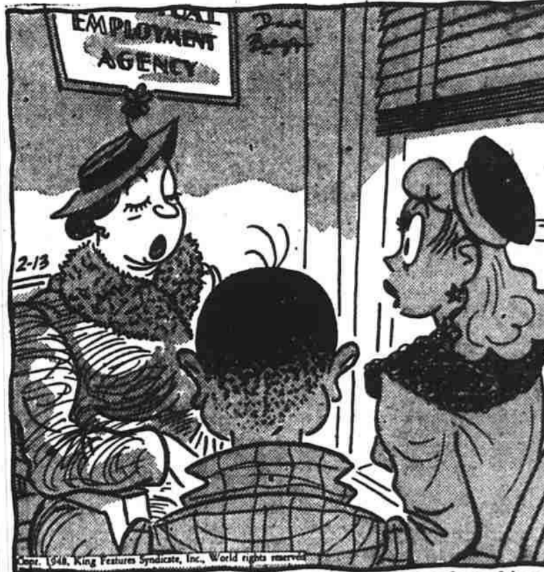
"What do you mean, I'll be treated as an equal working for you? In my last job I was BOSS!"