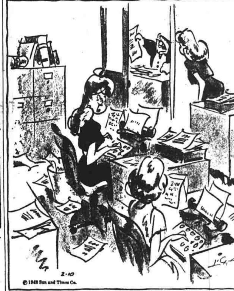
"I hate a man who's so intolerant -- he thinks that words can only be spelled one way!"