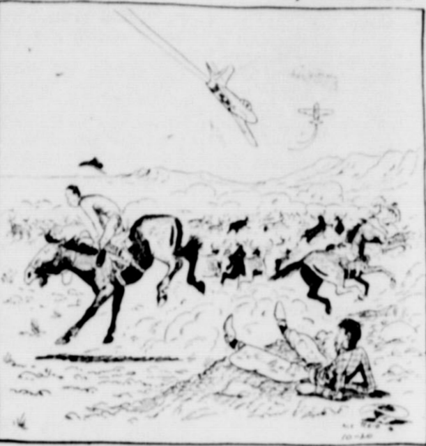
"Well! It took that dang air force just three seconds to undo what it took us three days to do!"

This feature sponsored by THE FIRST STATE BANK