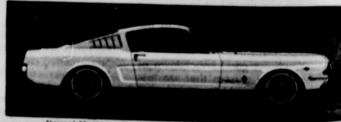
Newest Mustang—Fastback 2+2. Rear seats fold down for cargo.

We've added nineteen more horses to the standard Mustang engine this year. And for the same low price you get bucket seats, carpeting, padded dash, vinyl interiors, wheel covers and all the class-by-itself styling that has made Mustang the hottest new car in history.