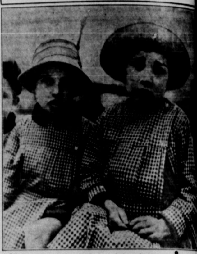
A poignant story is told. A story that needs few words but tells the Ailles-Australia, Belgium, British Commonwealth, Czechosi Free France, Greece, Luxemburg, the Netherlands, Norway, Poland Yugoslavla-are fighting on against aggression and for world These two children are French refugees who have lost their parents

Matadon Staffor The Us—V Has Mo SSE'S PLATE Drink, II Short Or