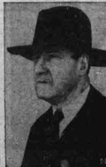
INDIGNANT Rabbi Stephen Wise, returning from abroad, warns against onward march of Fascism, reproached England for "dilatation" in recent Austrian seizure.