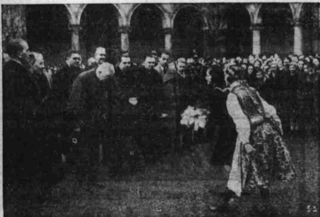
TIMES AS STIRRING as war days have marked Former President Hoover's visit to Europe where he's been touring countries he served as world war relief head. Above, Hoover bows to children at Cracow, Poland. Poland recently caused war scare with Lithuanian dispute.