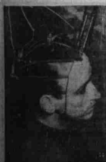
BRAIN at work is studied by means of device introduced in London to discover tumors and epilepsy, with this electrode-cap used for "listening" to brain.