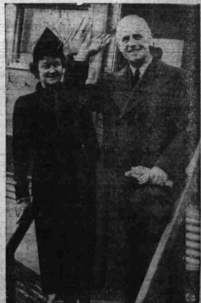
ANNEXATION OF AUSTRIA means bigger job for German foreign affairs minister, Joachim von Ribbentrop, seen waving farewell as he and wife leave for Berlin. The former ambassador to England, von Ribbentrop acted as special deputy for Hitler, negotiating anti-Comintern pact with Italy, Japan.