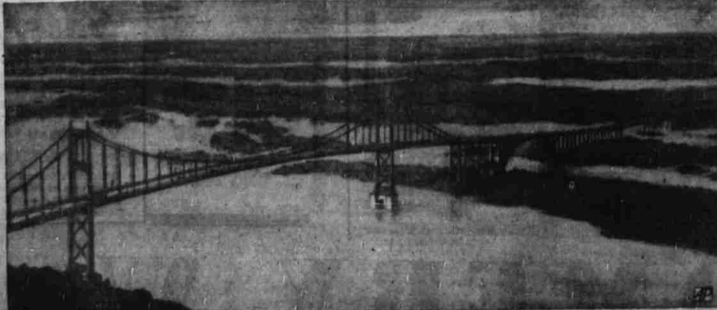
STEPPING ACROSS ISLANDS , an 5 1/4-mile-long international bridge linking U. S. and Canada will be built near Watertown, N. Y. Above is engineers' sketch. There will be five arches in the $2,200,000 span.