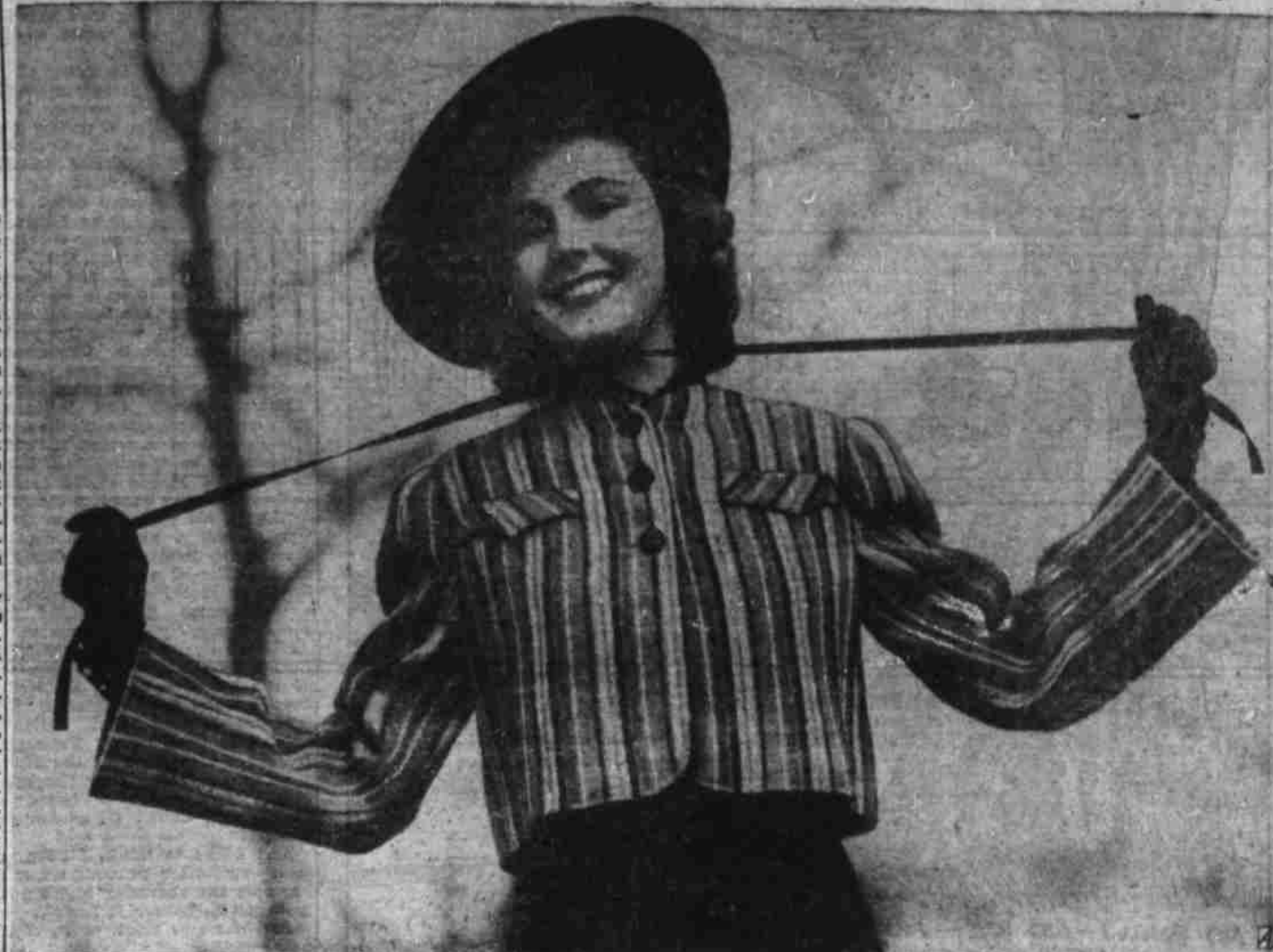
There is a "spring tonic smartness" to this season's use of stripes. One of the new costumes for immediate wear links a gray, green and wine striped wool bolero with a wine tweed skirt. It is worn with a big off-the-face felt hat.