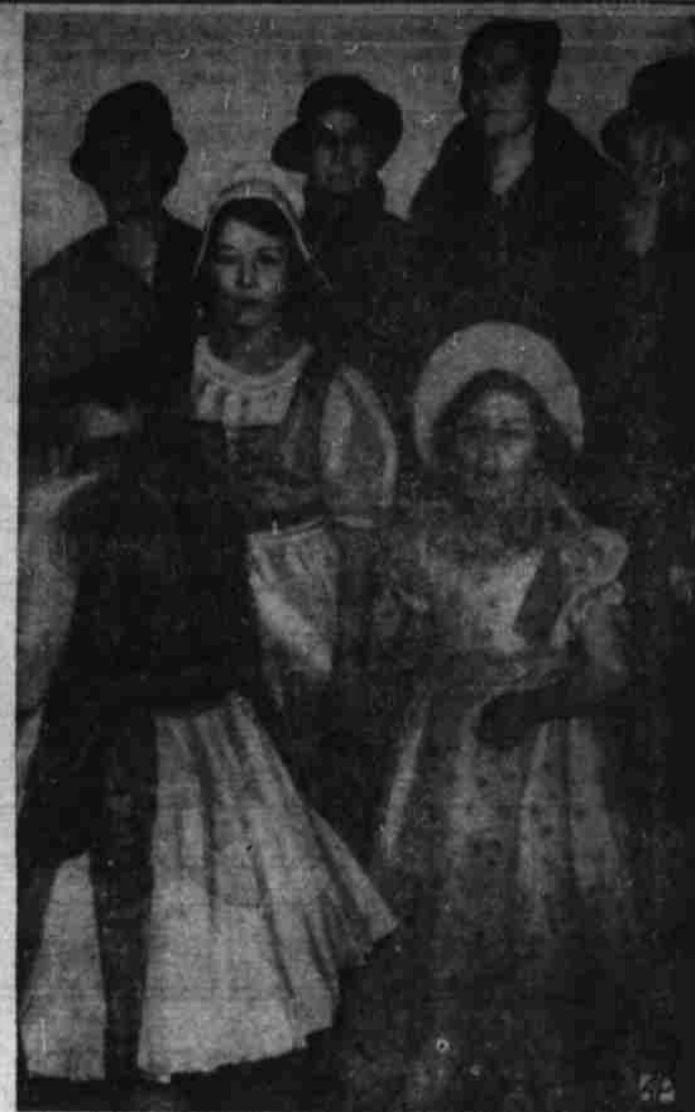
WITH QUEENLY POISE , Britain's Princess Elizabeth (left) guided sister, Margaret, about at Lady Astor's party.