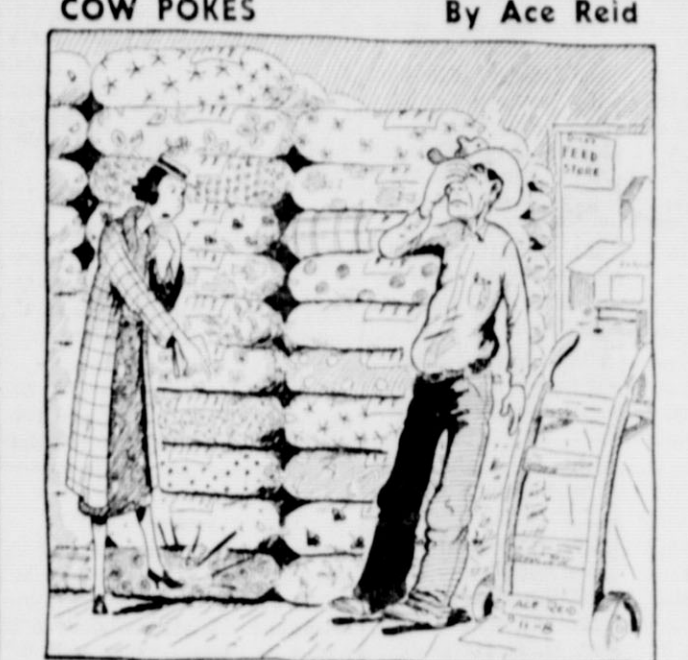
I'll take this one! It's such a nice print!