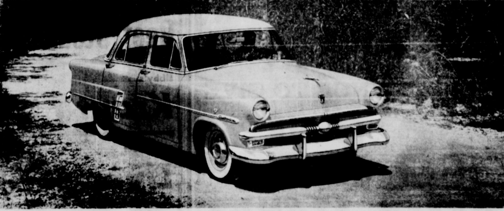
The New Standard of the American Road

If you've thought it takes gas-eating weight and hard-to-park bounce, pitch and sway to bother you, no uncomfortable roll length to give real riding comfort you ought to try this '53 on curves. Ford's new Miracle Ride marks a new era of riding Ford. For Ford's new Miracle Ride actually seems to lay a comfort and quiet. It's another big reason why Ford is worth carpet of smoothness even over the roughest roads. There's no more when you buy it . . . worth more when you sell it!