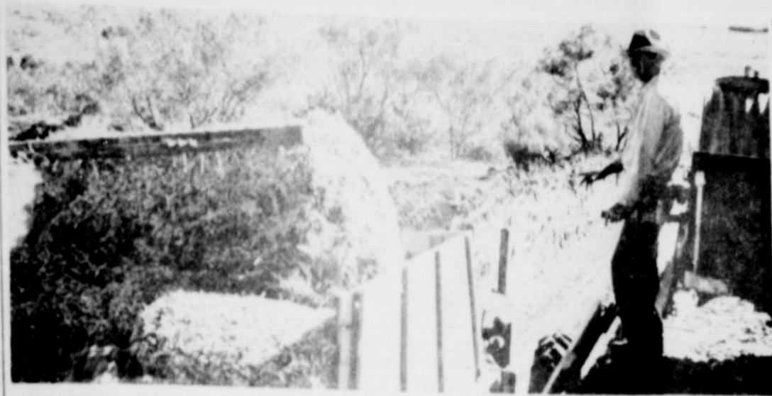
INGENIOUS TRAILER UNLOADER — Charles Long of Roaring Springs, above, is directing the unloading of ensilage in a big trench silo on his farm. He fastened heavy hog wire to the end of a trailer bed, then spread it on the trailer floor. Ensilage is blown out of the cutter on top of the wire in the field. To unload, a tractor is hitched to an attachment at the end of the wire, and the pull lifts the feed from the trailer floor and dumps it into the silo. The water tank is used for wetting down the ensilage. The trench silo above holds about 100 tons of feed.