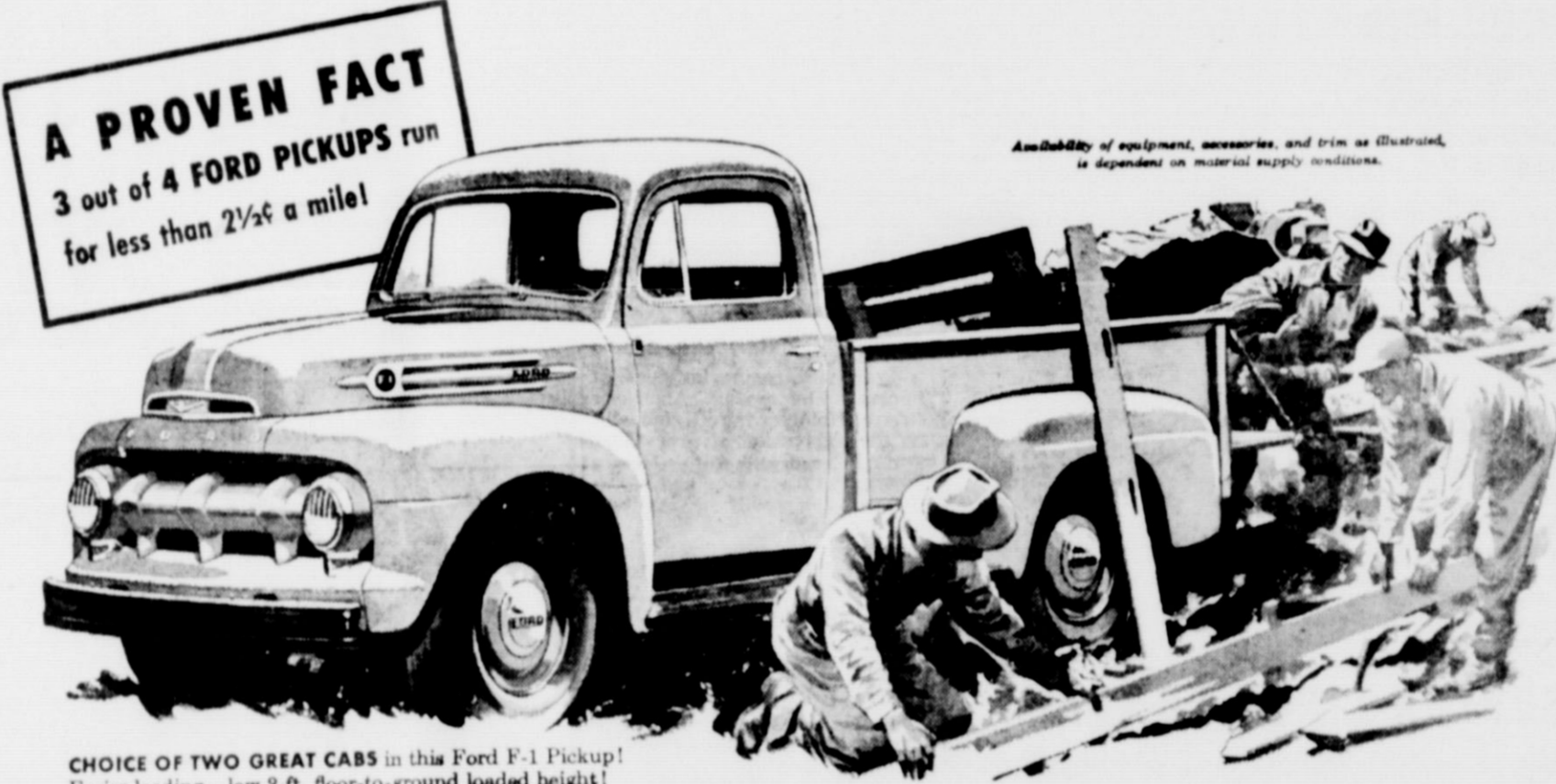
CHOICE OF TWO GREAT CABS in this Ford F-1 Pickup! Easier loading—low 2-ft. floor-to-ground loaded height!