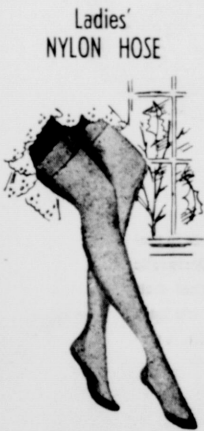
1st Quality, Fall Shades 51 Gauge, 15 Denier