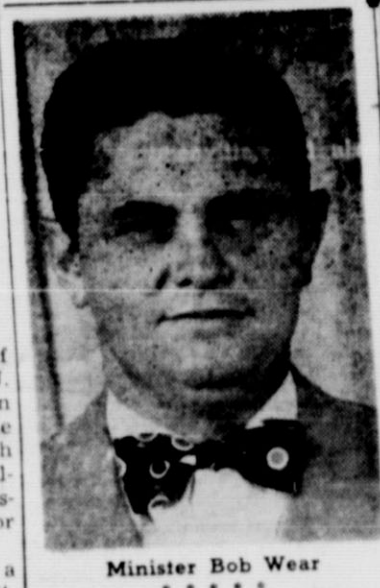
Minister Bob Wear