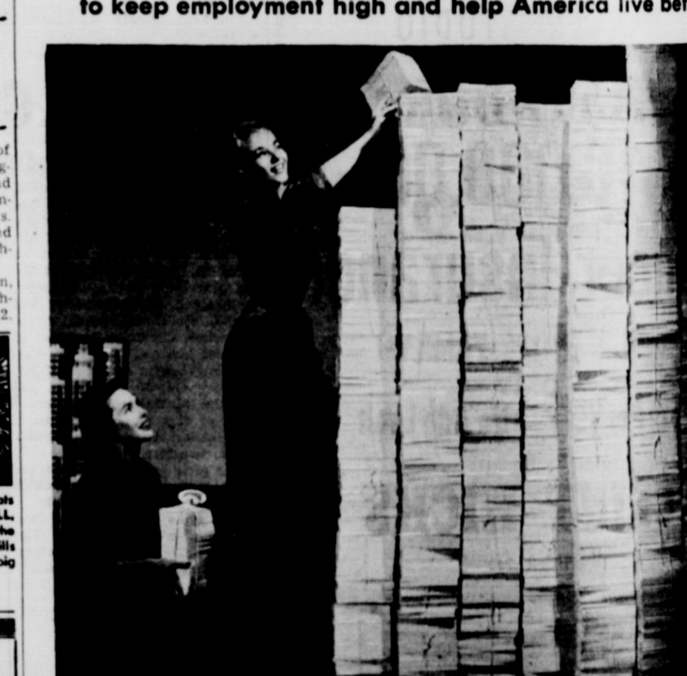
Tower of time cards shows jobs created by new G-E products. In a single pile, they'd reach 5 stories high.

New products create 45,000 G-E jobs in the last nine years And hundreds of new ideas are now being developed to keep employment high and help America live better