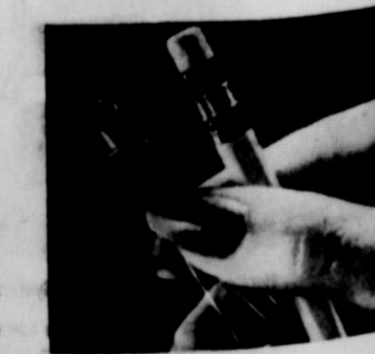
Tiny job maker. The G-E transistor, not much bigger than a pencil eraser, does the work of a full-size vacuum tube. It makes possible a wide variety of new electronic devices which will make your life more pleasant in the future and give employment to thousands of people.

All these fields—and many others—are so promising that we expect to produce more in the next ten years than in