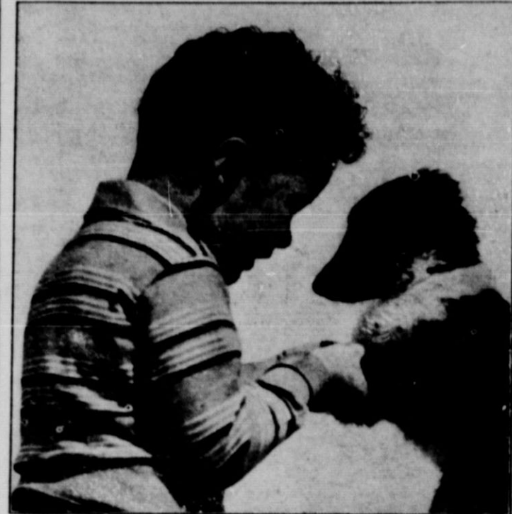
When taking pictures of children snap them in a natural pose-doing

"STAND up straight now and pies, or playing traffic policeman look at me." "Put your hands and you have astory picture with down darling, and smile. I want real human interest appeal. to get a good picture to send to Aunt Minnie