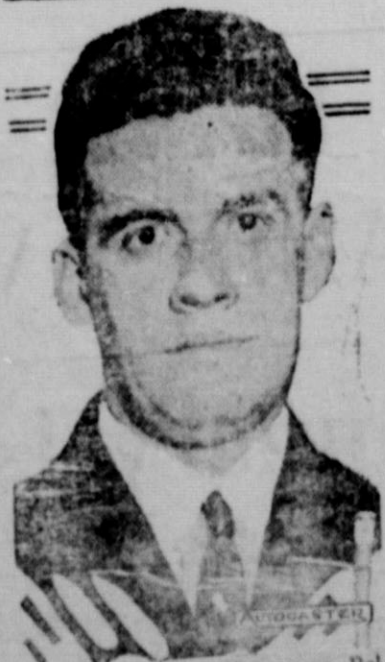
Here is Edward Horomans, Belgian cue sensation whose skill wrested the World's Billiard Crown from the brow of young Jake Shaeffer. This is the same crown that Willie Hoppe held for so many years.