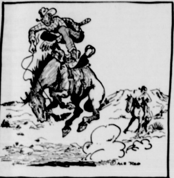
"Now if I could stand up on a buckin' hoss like this, play the guitar and sing 'Home on the Range' all at the same time, I bet I could get booked in Madison Square Garden!"

This feature sponsored by THE FIRST STATE BANK