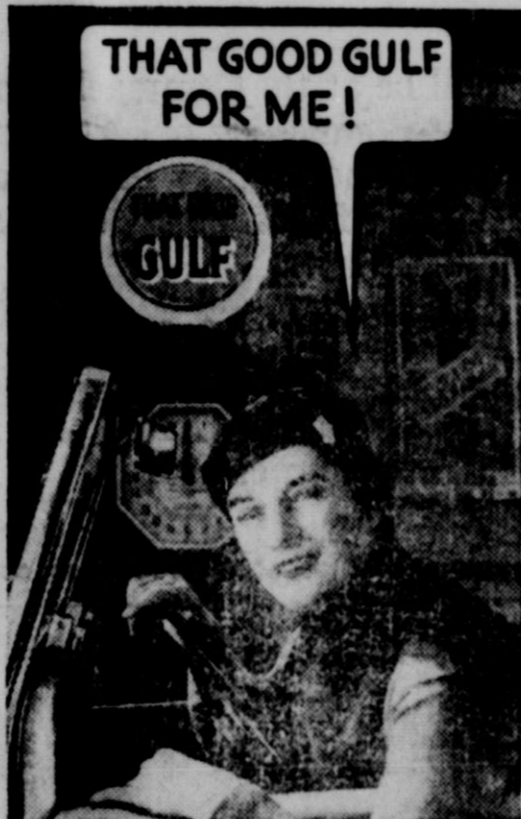
She's a shrewd shopper!