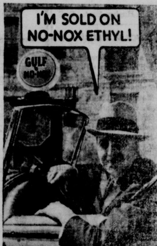
He'll pay more and get more!