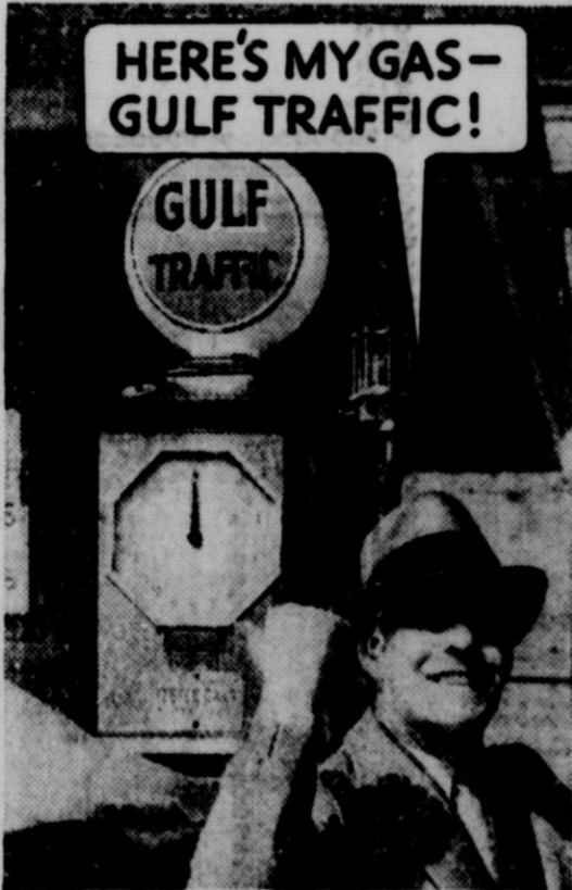
He knows his low-priced gasoline!