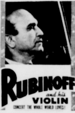
RUBINOFF and his VIOLIN CONCERT THE WHOLE WORLD LOVES! April 4th TUESDAY, 8:15 p.m. HIGH SCHOOL AUDITORIUM