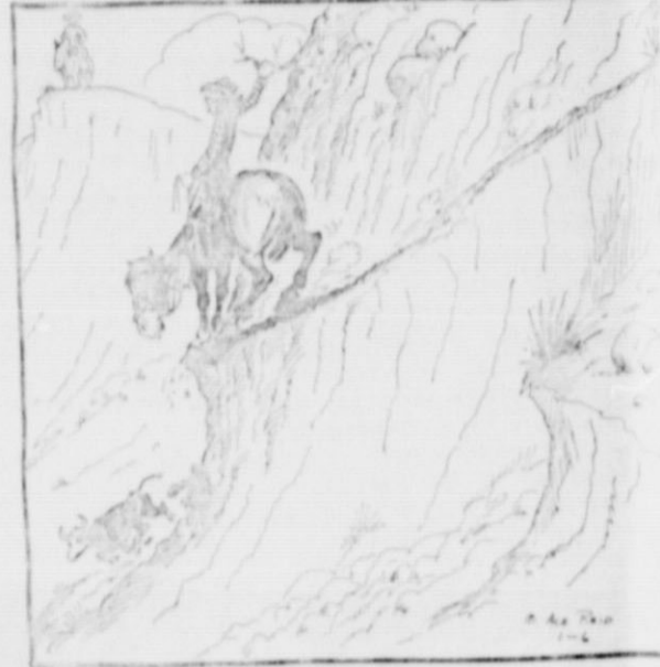
"You offered me a $100 for this hoss. Wul, I jist decided... come and git 'em!"

This feature sponsored by THE FIRST STATE BANK