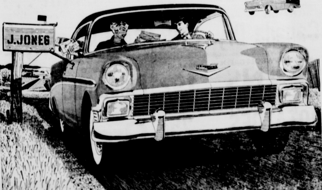
THE NEW BEL AIR SPORT COUPE with Body by Fisher—one of 20 frisky new Chevrolet models.