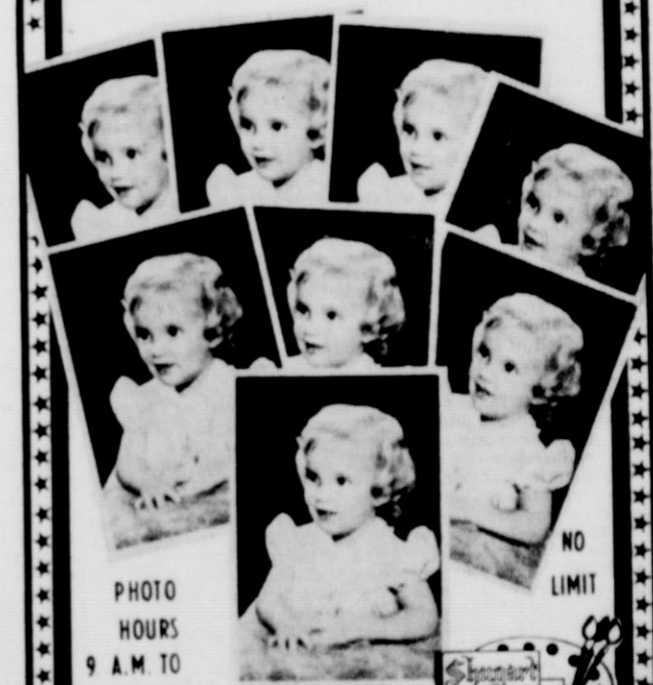
PHOTO HOURS 9 A.M. TO CLOSING

KING SIZE WALLET CREATIVE COLOR PORTRAITS FOR ONLY