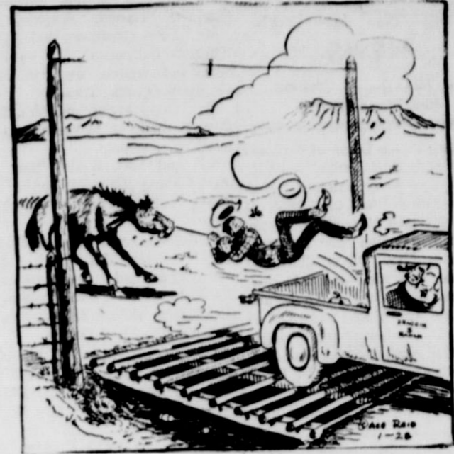
Hey, cattle guards ain't built jist to stop cows!

This feature sponsored by THE FIRST STATE BANK