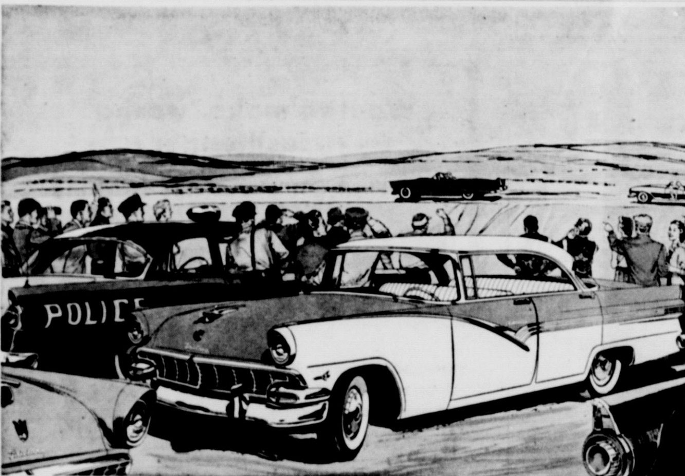
The Thunderbird's own record-setting 312 cubic inch engine can now be yours in most Ford models.