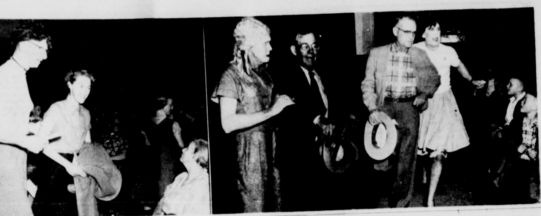
VOICE OF THE FOOTHILL COUNTRY Matador Tribune VOL. 62—NO. 3 MATADOR, MOTLEY COUNTY, TEXAS, THURSDAY, MARCH 29, 1956 PRICE SEVEN CENTS