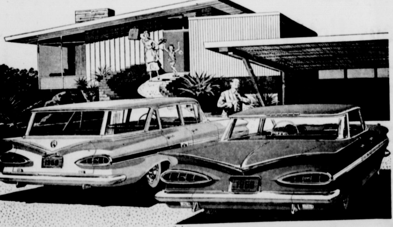
The 6-passenger Nomad and the Impala 4-Door Sport Sedan.

now—see the wider selection of models at your local authorized Chevrolet dealer's!