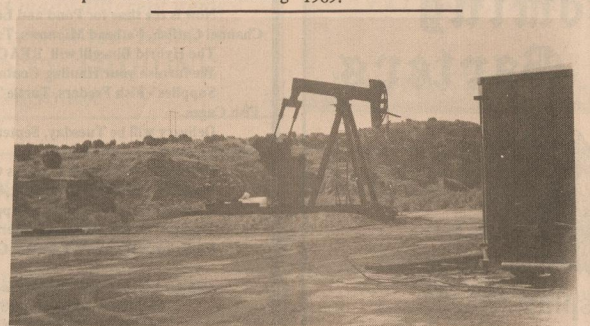
NEW OIL WELL — A new oil well in Motley County was completed and pump set on August 6. It is now pumping 160 barrels of oil a day and 20 barrels of water. The well is on Matador Land & Cattle Company land in the Salt Creek area, 23 miles east of Matador, operated by PLO, Inc. of Amarillo.

Special class reunions to be celebrated will be the classes of 1924, 1929, 1934, 1939, 1944 (50th), 1949 (55th), 1954, 1959, 1964, 1969, 1974, 1979, 1984, and