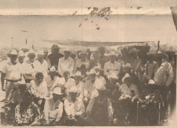
MEET FOR REUNION — Cowboys that once worked for the Matador Ranch gathered for their 1st Annual Cowboy Reunion, August 27, in Roaring Springs during the 71st Annual Old Settlers Reunion.

A new addition to the Old Settlers events this year was the First Annual Matador Cowboy Reunion held on Sat-urday, August 27 under the Chuckwagon fly near the Dutchman Creek Bridge