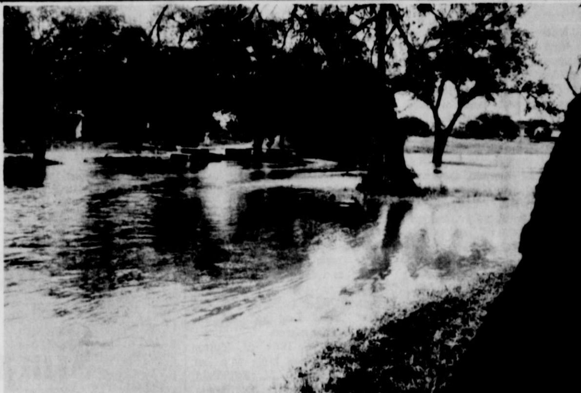
IT LOOKS DIFFERENT NOW — This is the way the City Park looked in the late afternoon of Monday, June 11, following as much as 3½ inches of rainfall. Park benches are in the center, and to the left is the VFW Building. Dry weather for the past week and temperatures of 90 and 100 plus degrees have erased all traces of the "little flood."