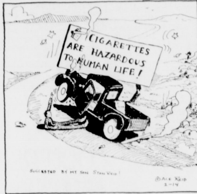
"Yeah, and so is cars!"

This feature sponsored by THE FIRST STATE BANK