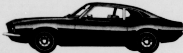
1971 MAVERICK 2-DOOR SEDAN

Maverick. Right price for a simple compact car.