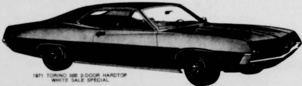
1971 TORINO 300 2-DOOR HARDTOP WHITE SALE SPECIAL

Maverick. Right price for a simple compact car.