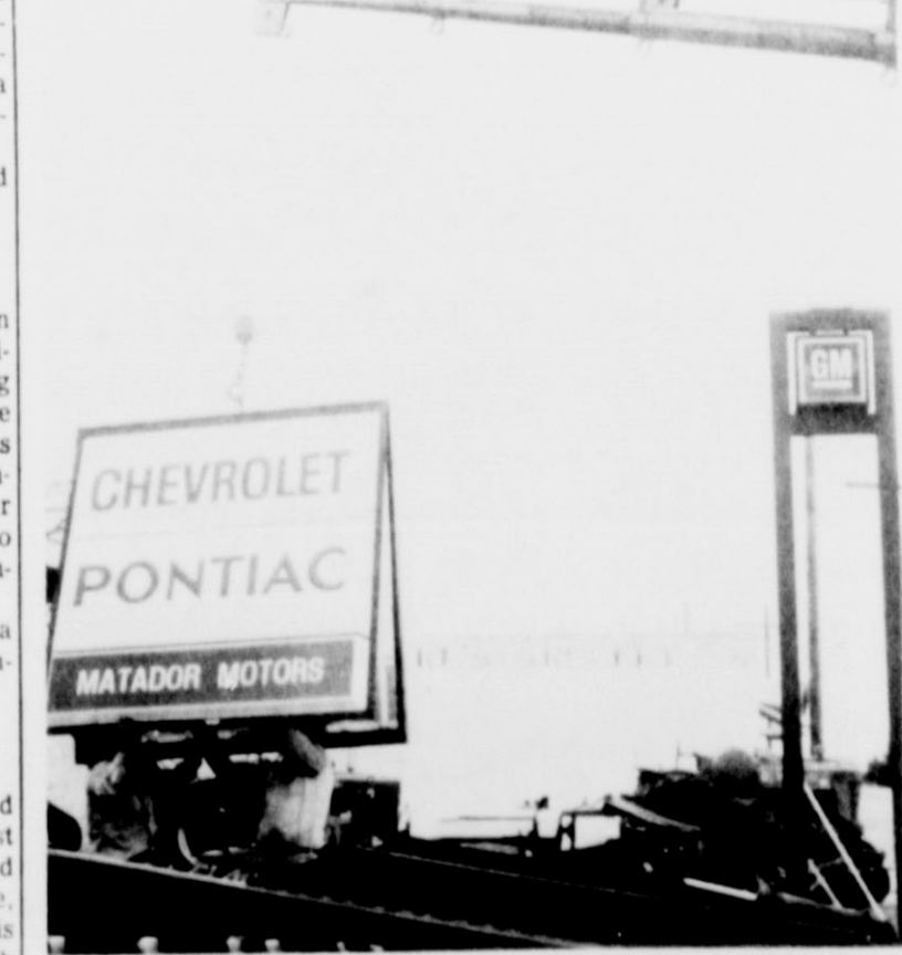
NEW SIGN ON THE ROAD—New Chevrolet and Pontiac sign installed last week for Matador Motor and Implement Co. on Highway 70 (Bailey Street). Photo shows hoist holding sign as workmen make adjustment. The sign is now located on top of the metal (GM) frame at the right. The sign is lighted and visible from east and west.