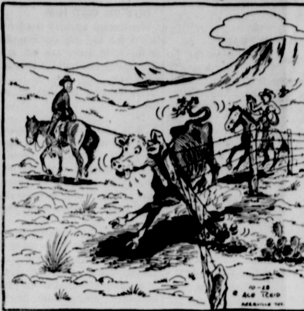
'Yeah, you shore throw wide loops—now lets see how your gonna throw that fence back in shape.'

This feature sponsored by THE FIRST STATE BANK